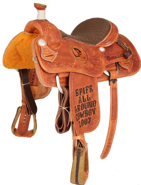
Saddle for illustration